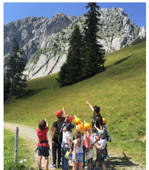
Rock Climbing at the Wandflue