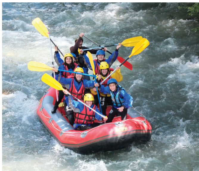
Rafting the Sarina River