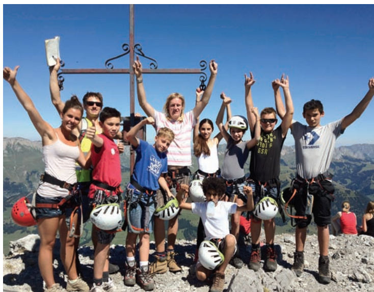
Conquering the Rüblihorn Via Ferrata - 2285 meters