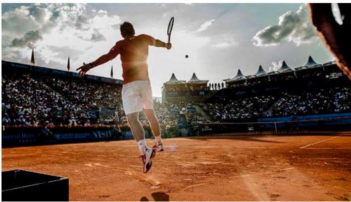
Swiss Open Tennis Tournament

Bouncing on the trampoline and slack-lining were two favourite activities last year, so both will be options to enjoy again this summer. Campfires will be entertaining to say the least this summer with skit nights and talent shows already planned! Senior campers will be busy preparing to host a Carnival Night for the junior campers. We also have some exciting excursions planned to go wakeboarding on the Lake of Thun, exploring and shopping in the capital, Bern and of course splashing around at the Aquaparc. Campers will have the opportunity to experience the Gstaad Volleyball Tour, Swiss Tennis Open, the Menuhin festival and the Hublot Polo. The calendar is jam packed with events and it is guaranteed to be an unforgettable summer at Lovell International Camps!