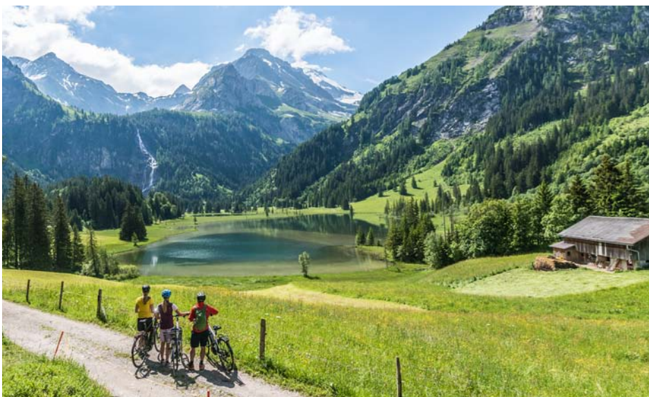
Mountain Biking at the Lauenensee