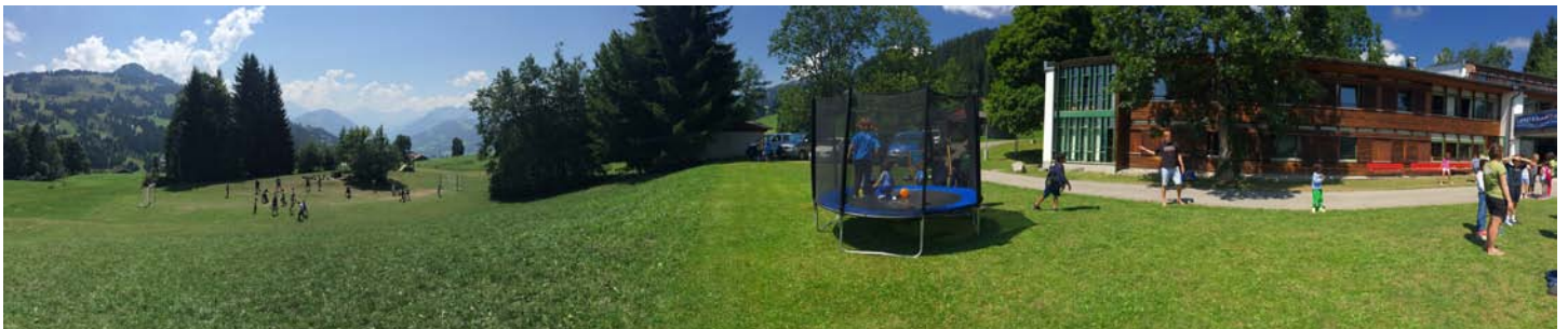
So much to do around the Mountain Lodge