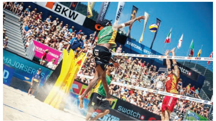
Beach Volleyball World Tour Stop - Gstaad