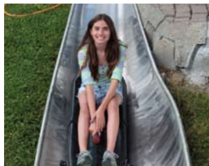
RELLERLI ROLLER COASTER