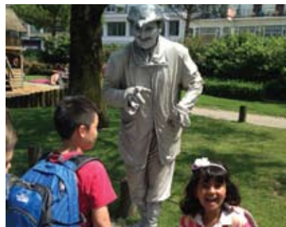
FUN IN MONTREUX

I went to the high ropes course on August 11th. When I first saw it I thought it was really high and scary. But when I started the course, it was really fun, I had a great day!