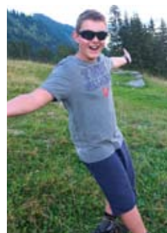
TIKHON - ESTONIA