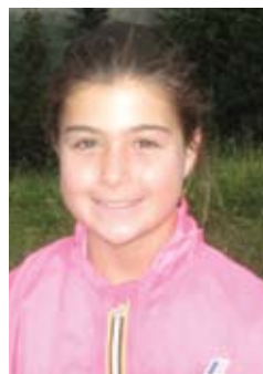
LILLY - SWITZERLAND