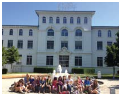
CAILLER CHOCOLATE FACTORY