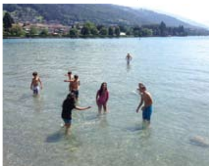
FUN IN THE LAKE OF THUN