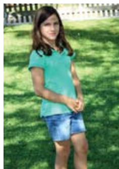
JOIA - BELGIUM