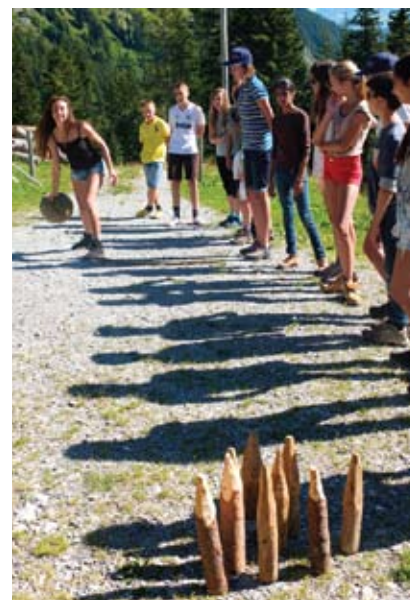
TRADITIONAL SWISS BOWLING