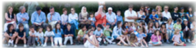
July Outstanding Camper